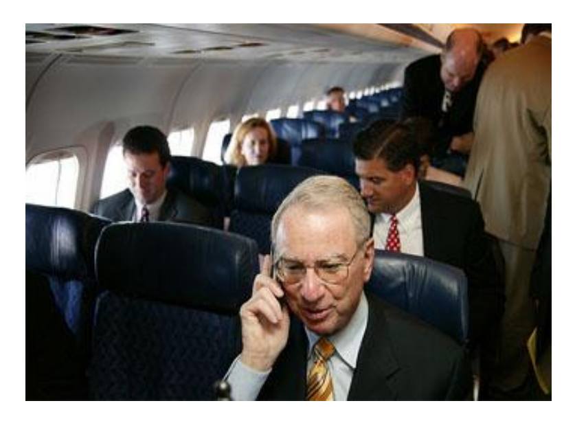
Figure 2: Travelers can bring just two cellular phone; a new and a used one.