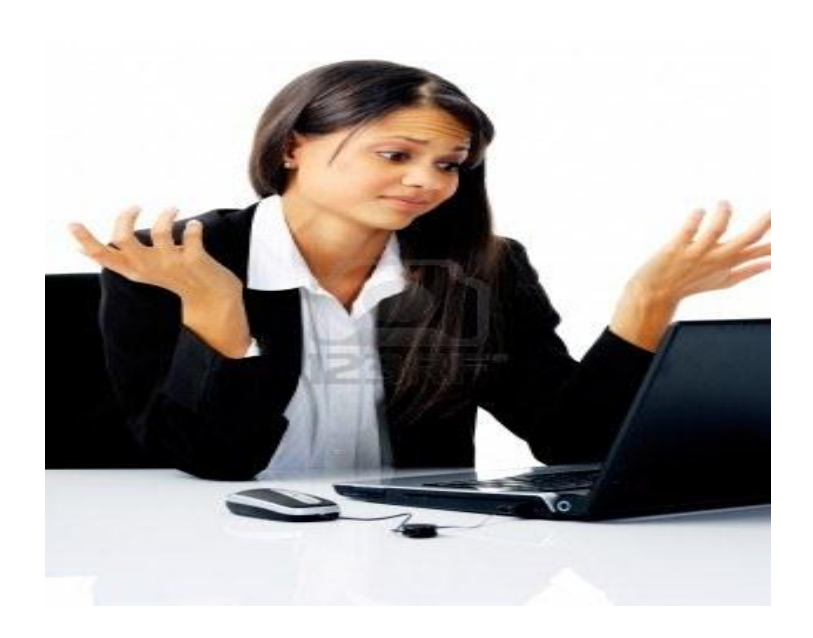
Figure 1: English speaking tourists do not count on with the Information.