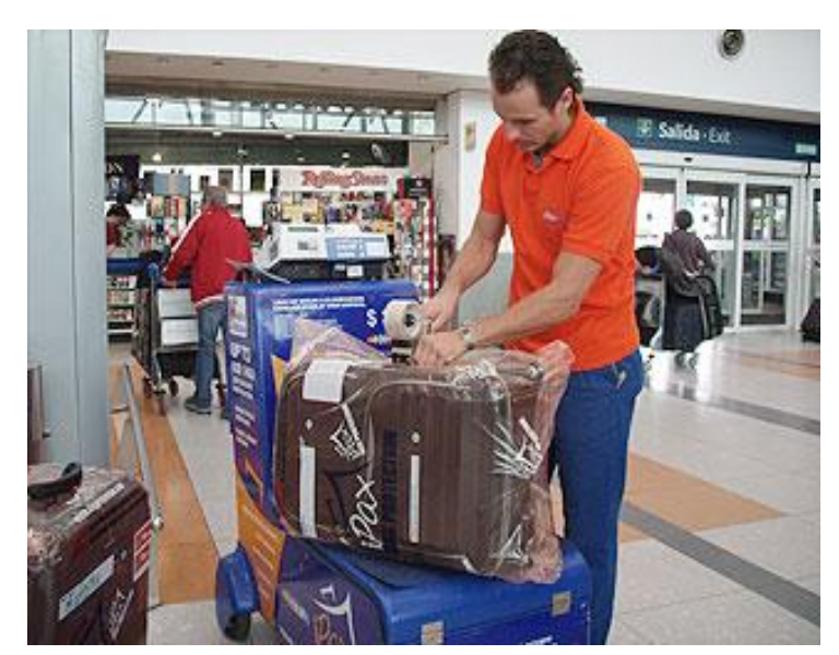
Figure 3: More tourist arrive to the country and they are subject of fines.