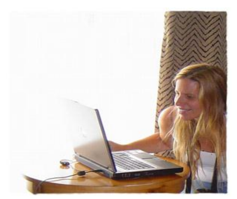
Figure 4: The Resolution translated into English is a source of important information for English speaking tourists.